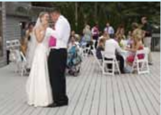
Conference Center Deck