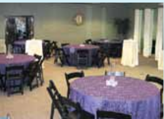
Conference Center Ballroom