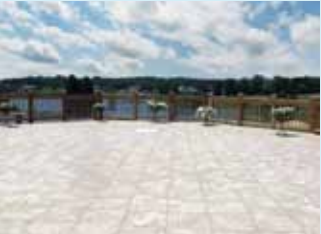
The Compass Deck at the Pavilion