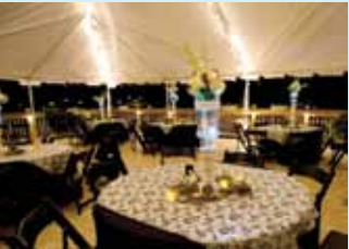
The Sun Deck at the Pavilion

The panoramic views and relaxed atmosphere at Bernard's Landing make this the perfect place for weddings, reunions, meetings, retreats, and special events.